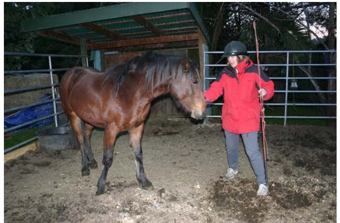
Bay Colt (now "Chinook")