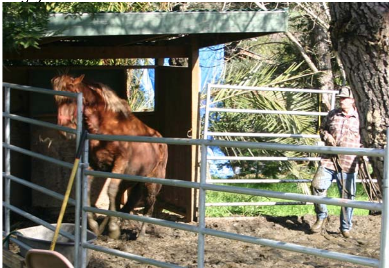
Red Filly (above: "Before", right: "After")